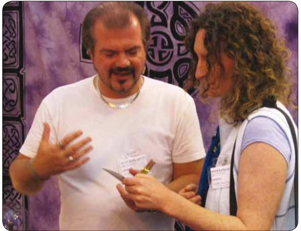
Exchange of views at a 'Mind and Spirit' Fair

Paul however, has also become aware of a similar debate in Greek religion with some suggesting that Zeus is not just one god among many but that he is in fact the true creator God. That is why