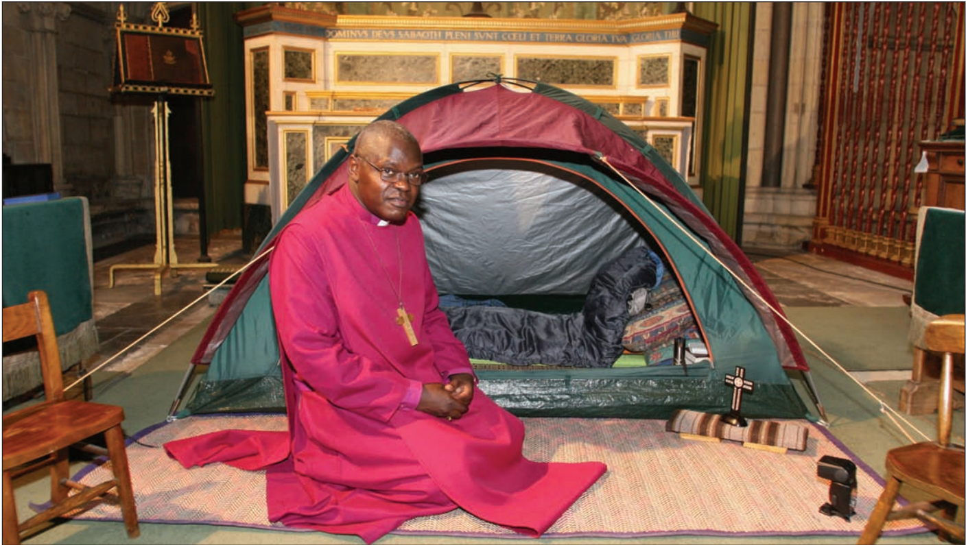
ARCHBISHOP DESMOND TUTU IN A TENT IN 2012 the Archbishop of York gave up a family holiday in Austria to live and fast in a tent in York Minster for a week as part of an act of public witness to encourage peace in the Middle East. Afterwards the Archbishop said: This act is a rallying call to people of all faiths and none, to encourage them to feel that there is something that can be done

I want to question. I do not believe that all is lost as far as the Christian roots of our society are concerned. Nor do I accept, as is argued by some, that our society is in some way 'broken', as if all we needed was a new Mr Fixit.